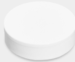
BLE Asset Tag