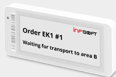
E-Ink Display Beacon