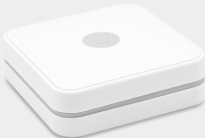
insoft Locator Beacon