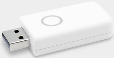
insoft Locator Node Dongle